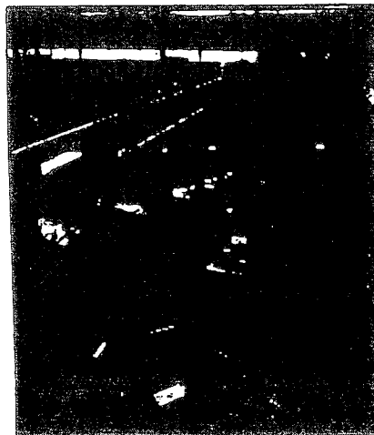
Support staff: now the whole hive buzzes

the people they wanted to keep and those they could do without. This resulted in another 10 firings.